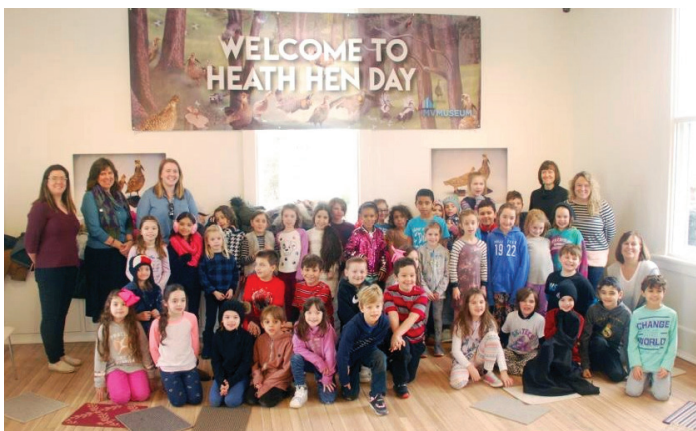
Oak Bluffs second graders were the first students to visit on a field trip celebrating Heath Hen Day in the Morgan Learning Center.

Perhaps the most encouraging and heart-warming signs of early success came in the sheer numbers of Islanders and visitors who flooded through the museum doors. Even before we opened, MVM welcomed over 300 members from the MV Chamber of Commerce for a sneak preview in January. More than 100 Island educators also toured the facility in early March while the painters were perfecting the finishing touches, and a lucky class of Island schoolchildren celebrated Heath Hen Day in the still-closed galleries and classroom.