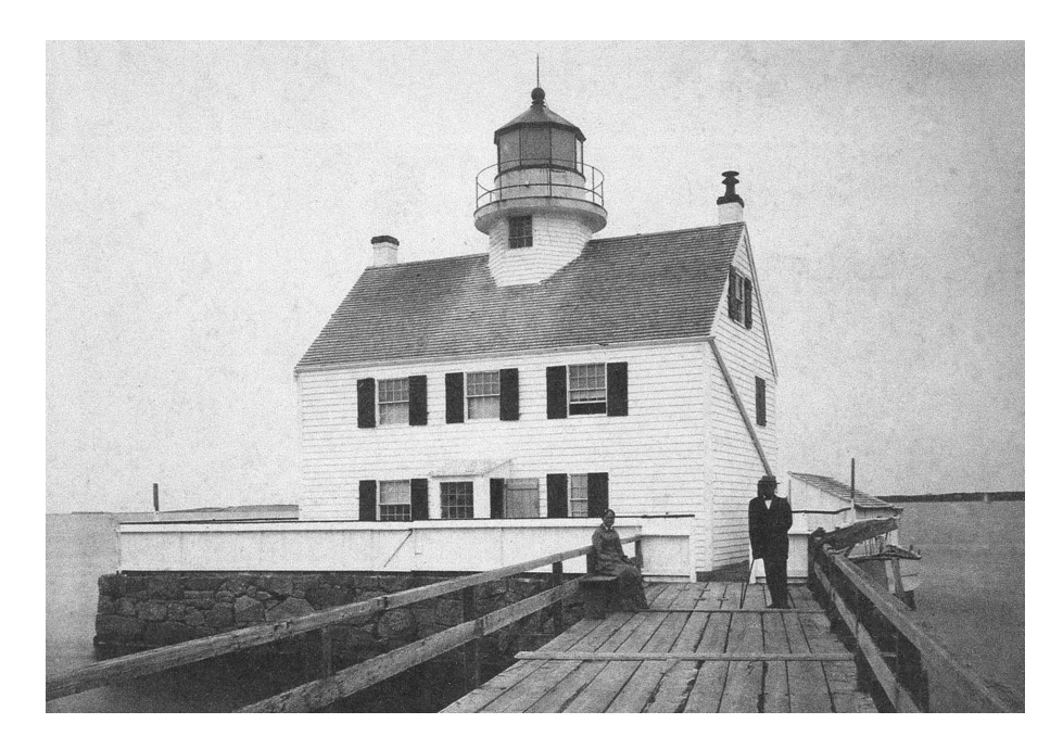
Edgartown Lighthouse photos from MVM archives...can you spot the differences?