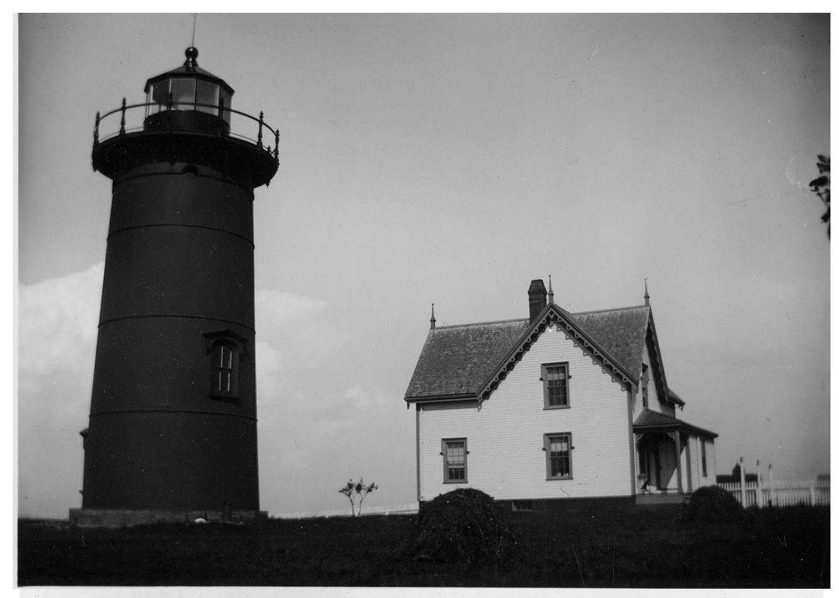
East Chop Lighthouse photos...can you spot the differences?