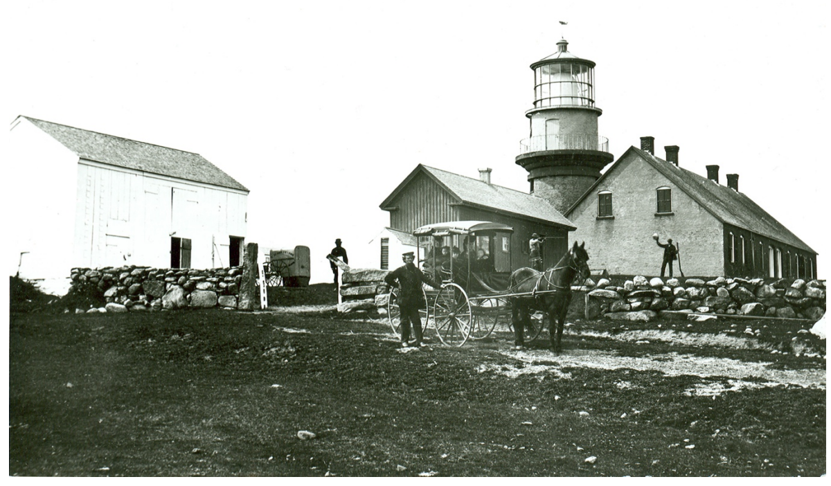
Gay Head Lighthouse photo from MVM archives...can you spot the differences?